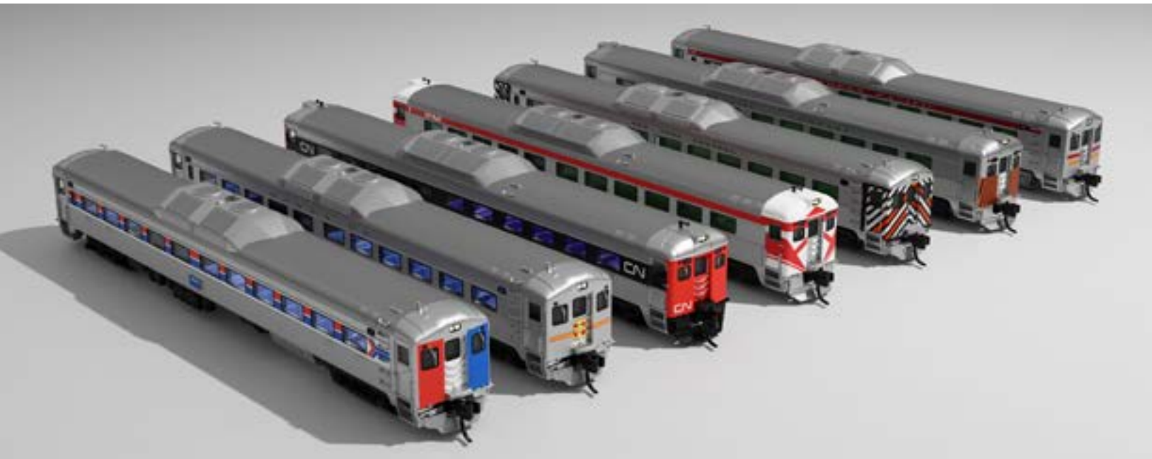
Left to Right: Amtrak, Santa Fe, Canadian National, Canadian Pacific, New York Central, Reading and Southern Pacific