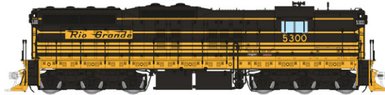
PRELIMINARY ARTWORK AND DRAWINGS. SUBJECT TO CHANGES OR REVISIONS BEFORE PRODUCTION.