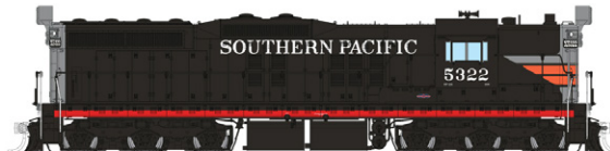
PRELIMINARY ARTWORK AND DRAWINGS. SUBJECT TO CHANGES OR REVISIONS BEFORE PRODUCTION.