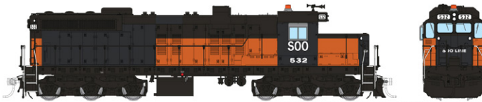
PRELIMINARY ARTWORK AND DRAWINGS. SUBJECT TO CHANGES OR REVISIONS BEFORE PRODUCTION.