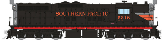
PRELIMINARY ARTWORK AND DRAWINGS. SUBJECT TO CHANGES OR REVISIONS BEFORE PRODUCTION.