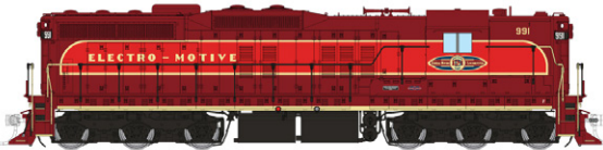
PRELIMINARY ARTWORK AND DRAWINGS. SUBJECT TO CHANGES OR REVISIONS BEFORE PRODUCTION.