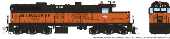
PRELIMINARY ARTWORK AND DRAWINGS. SUBJECT TO CHANGES OR REVISIONS BEFORE PRODUCTION.