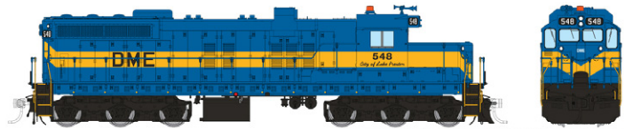
PRELIMINARY ARTWORK AND DRAWINGS. SUBJECT TO CHANGES OR REVISIONS BEFORE PRODUCTION.