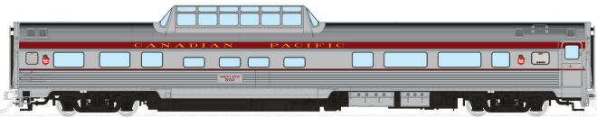
Canadian Pacific (Maroon Scheme)

Item # Road # Item # Road # 116041 503 116042 510 Item # Road # 116043 516